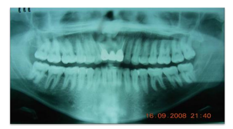
Figure (4): showing dentigerous cyst with impacted of upper central incisor.