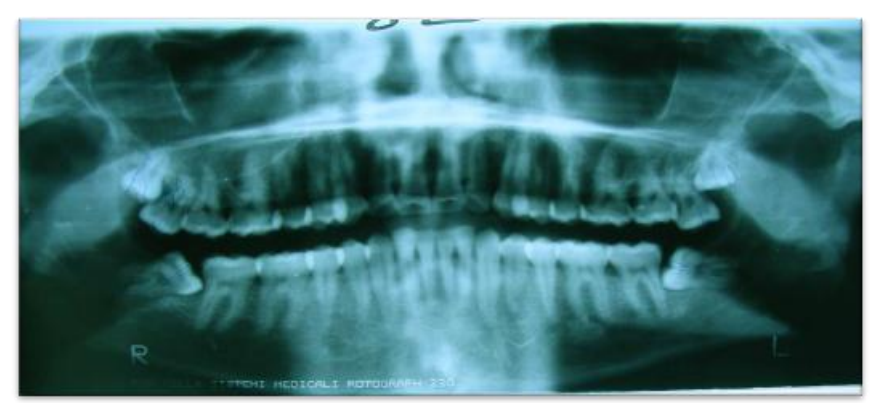
Figure (3): showing supernumerary teeth in upper right and left side