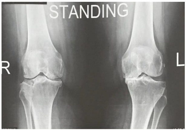
Fig. (2): X-ray P.A view both knee standing position.