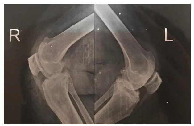
Fig. (3): X-ray of both knee lateral view.