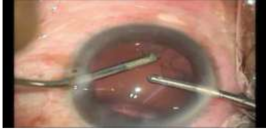
Figure (3): Irrigation and Aspiration.

Nuclear phaco chop: Vertical chopping was performed with pointed-tip chopper, the nucleus was chopped into several pieces each of which was emulsified and aspirated (Figure 2). Regarding cortical clean up, the cortical fragments were engaged by vacuum /pulled centrally and aspirated by manual aspiration method or bimanual automated method (Figure 3). Foldable hydrophilic IOL was implanted in the capsular bag followed by washing of the viscoelastic and hydration of the wound (Figure 4). Peripheral iridectomy was performed using capsulorhexisforeceps and scissors to cut a section of iris at 12 o'clock.