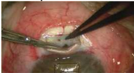
Figure (5): Trapdoor with peripheral iridectomy.