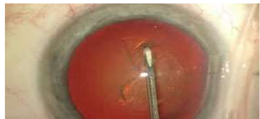
Figure (1): Capsulorhexis with cysttome.

Preoperative measures were taken prior to the beginning of the procedure. Topical anesthetic was instilled into conjunctival sac, local anaesthesia peribulbar block was given through skin, povidone-iodine 5% or chlorhexidine was instilled into conjunctival sac and also used to paint the skin of the eyelids. Careful draping was performed ensuring that the lashes and lid margins are isolated from surgical fields and Speculum was inserted. The main incision was clear cornea; aside port incision was made around 60 to the left of the main incision. Continuous curvilinear Capsulorhexis was performed with cystotome (Figure 1) or capsule forceps and involve two movement, shearing in which atangential vector force was applied along the direction of the tear, ripping in which centripetal vector force strains and tear the capsule. Hydrodissection was performed to separate the nucleus and cortex from the capsule so that the nucleus could be more easily and safety rotated, 26-gauge blunt cannula with fluid was inserted just beneath the edge of the rhexis and fluid was injected gently under the capsule, hydro dissection wave should be seen provided there is good red reflex.