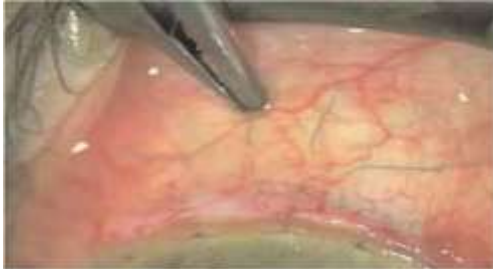
Figure (6): Closing of scleral and conjunctival flaps.

Preoperative measures were taken and the same previous anesthesia was done. Conjunctival flap (fornix based flap): Technique perio to my of 6 mm without releasing incisions advantages –easier to perform, disadvantages anterior leak is common, cautery applied to any bleeding episcleral vessels. Scleral Flap: Cut partial thickness flap typically 2-3 mm posteriorly by 4 mm wide. Raising the flap with crescent or pocket knife and extend it into clear cornea. Paracentesis was performed in upper temporal peripheral cornea to allow the anterior chamber to be reformed. The Trapdoor (Figure 5), an incision 3-4 mm was made along the line of sclera spur into the anterior chamber and another incision was made 2 mm in front of it (rectangular window). This involve sclera spur, canal of schlemm, trabecular meshwork and peripheral cornea. The sclera window include small portion of the cornea to ensure that the whole trabecular meshwork and canal of schlemm were included in the excised portion. Iridectomy: To remove iris tissue from internal limbal opening to prevent blocking of internal opening by peripheral iris. The sclera flap was repositioned and sutured at 2 posterior corners (using 8/0 virgin silk), closing the conjunctiva, injection of BSS through paracentesis to test patency of fistula (Figure 6).