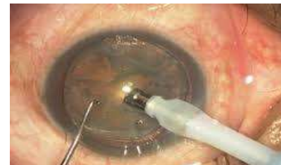
Figure (2): Nuclear management.