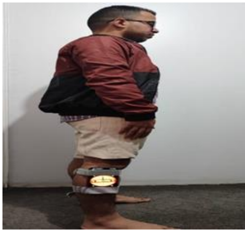
Fig. (3): Starting position.