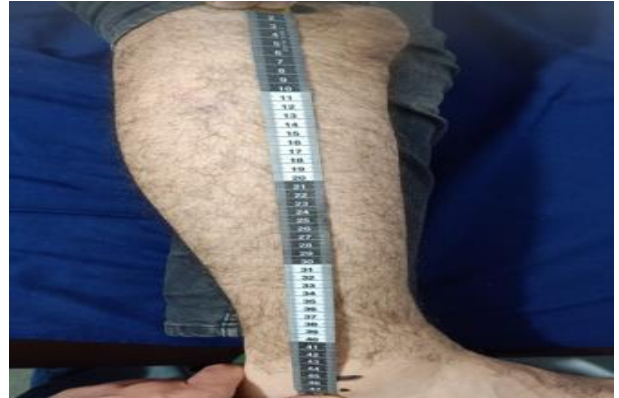
Fig. (1): Measuring moment arm.

The subjects had to exert their strongest knee extension for five seconds. Results shown on HHD have been recorded (18). The goniometer was attached to the top third of the lateral side of the dominant leg along the joint line to measure.