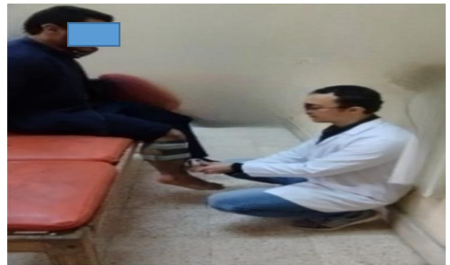
Fig. (2): Measuring quadriceps muscle strength by Lafayette HHD.

Position sense in the knee joint. The test began with the knee extended ( figure 3 ) and the subjects were instructed to squat until they achieved the objective (predefined) angle of 50°, which is equivalent to the middle range of knee flexion shown in ( figure 4 ). The individuals were blindfolded and instructed to hold the goal angle for 5 seconds before returning to the beginning position (full knee extension). The patients were instructed to replicate this angle three times in order to calculate an average and record the angles (19).