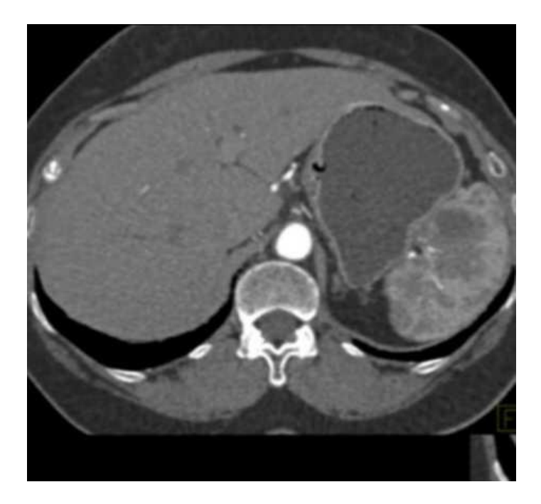
Figure 1: Showing CT contrast with splenic masses metastasis

Continuous variables were presented as mean<u>+</u>standard deviation (SD) and were compared by the Student t-test if normally distributed or by Mann-Whitney test if abnormally distributed. Qualitative data were presented as frequency and percentage and were compared with the use of the Fisher's exact test. P <0.05 was considered significant. IBM SPSS software program version 20.0 was utilized to examine the data that was supplied into the computer (Armonk, NY: IBM Corp).