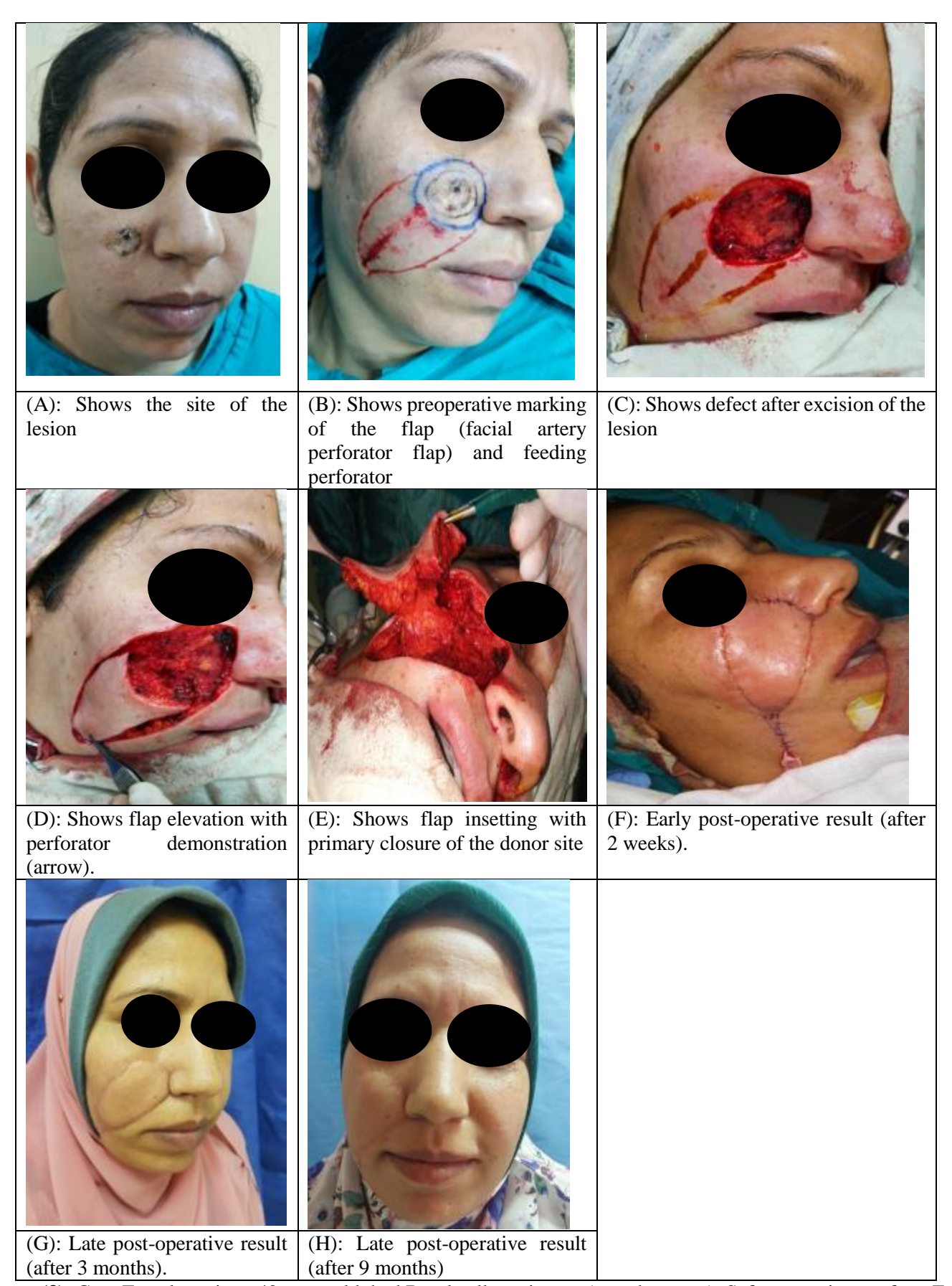
Figure (3) : Case Female patient, 42 years old, had Basal cell carcinoma (morphea type). Safety margins are free, Zone 4; cheek (para-nasal; beside right nasal ala).

Received: 28/10/2022 Accepted: 31/12/2022