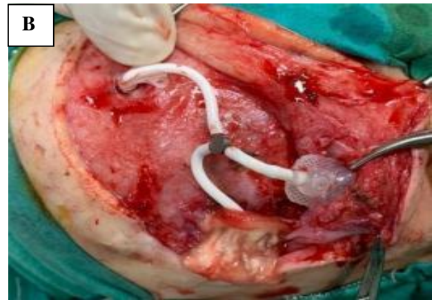
Fig. (1): Different types of Y connector connecting the lateral and 4 th ventricular catheters to contoured valve. A) Silicone Y connector type of Medtronic. B) Titanium Y connector of Integra.