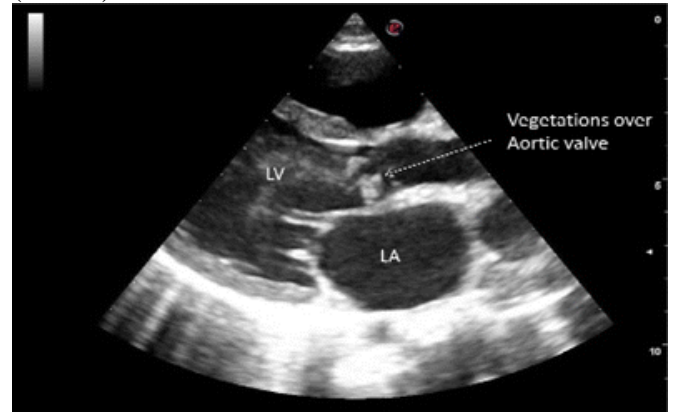
Figure (2): TTE showing aortic valve vegetations.

The following regimen was applied for treatment of all patients: After admission, the 1st line for IE treatment was IV double antibiotics for 2 weeks, in case of partial improvement, antibiotics continued for another 4-6 weeks until the case totally improved. If no response, or negative culture, empirical therapy was indicated. In case of prolonged hospital stay (>2 weeks) or suspected fungal infection, antifungal treatment was indicated. If the case deteriorated or complicated, surgery was indicated. In the current study, we considered: Partially improved means improved clinical signs and laboratory but vegetation is still detected tests. bv echocardiography. Totally improved means no clinical signs of IE and normal laboratory tests and echocardiography findings. Deteriorated means deteriorated clinical signs and laboratory tests or developed complications e.g., embolism, heart failure. Patients were assessed at admission, then after 2 weeks and 4 weeks to detect patients' outcomes including mortality, need for surgery, extra-cardiac complications.