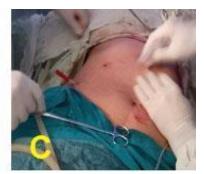
Figure (1): (A) Rupture of GB during dissection, (B) Extraction of stones, and (C) Drain fixation. Follow-up: Following surgery, all patients were examined clinically (at 1, 2, 4 weeks postoperatively) and radiologically.