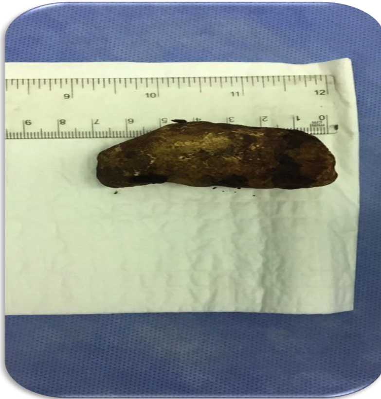
Figure 3: Ppostoperative photo showing the size of the gallstone, 7cm x 3cm x 2.5cm.