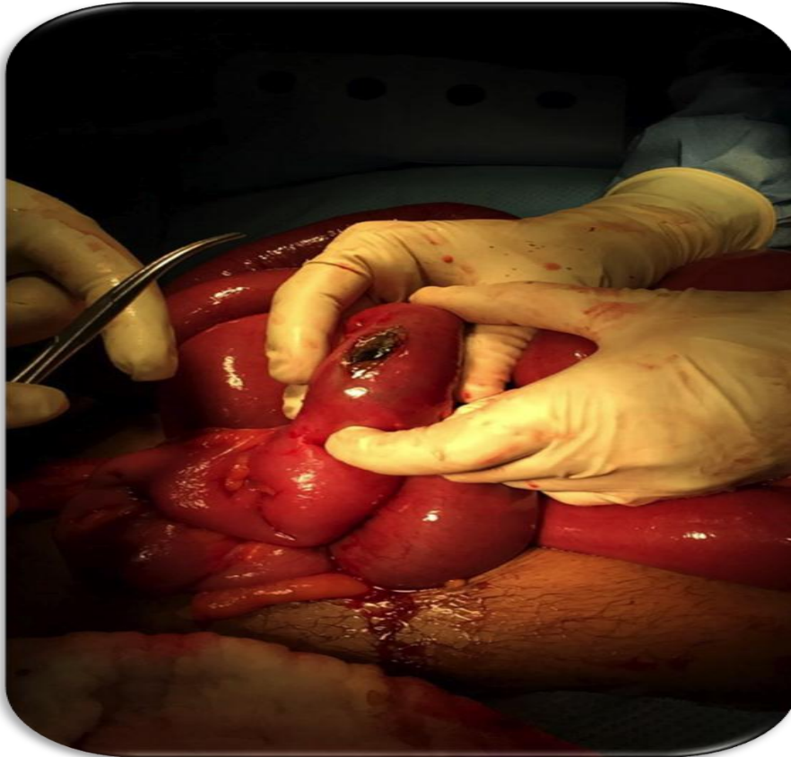
Figure 2: Intraoperative photo demonstrates the site of enterotomy.