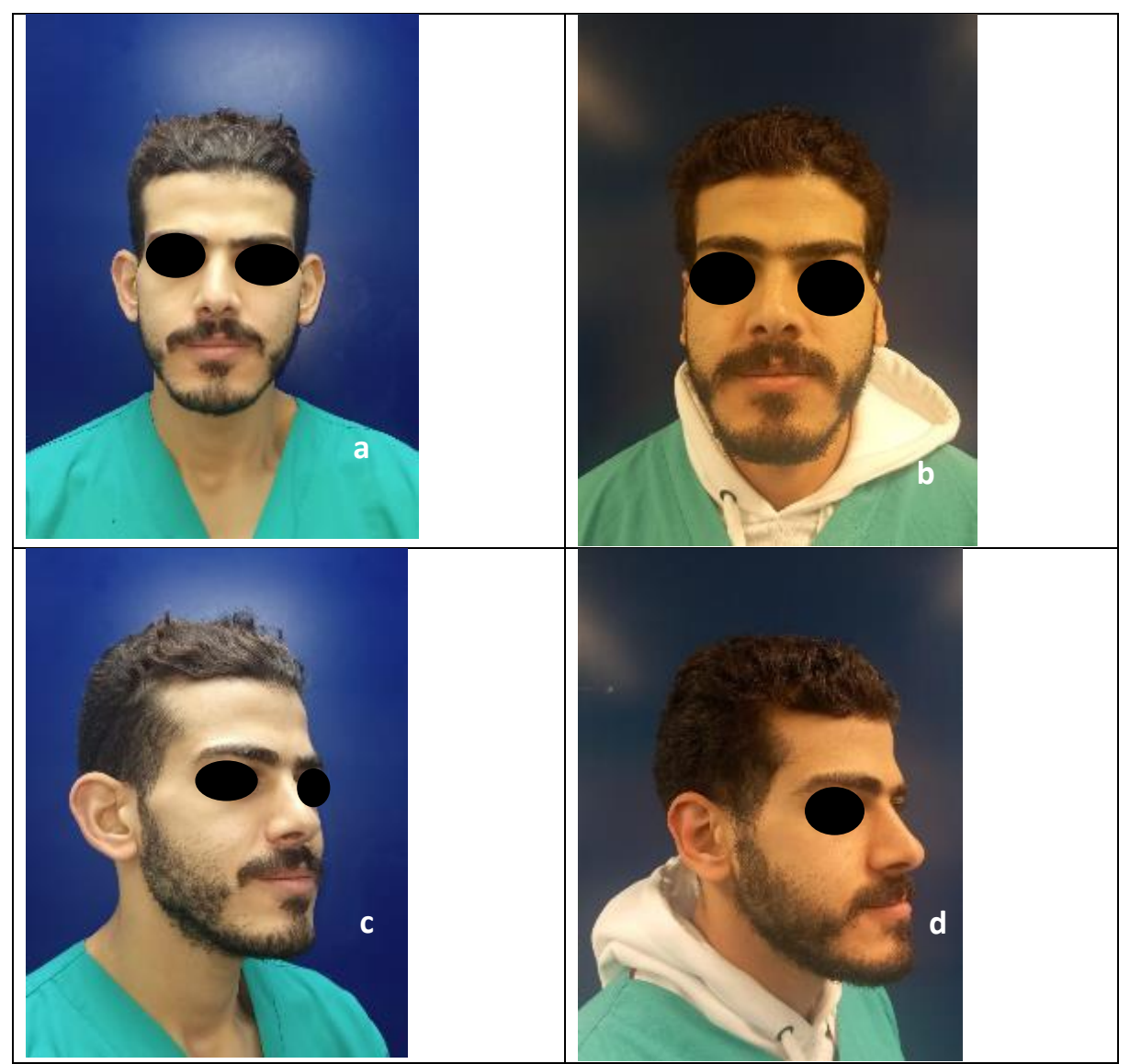
Fig (12): Preoperative 33 years old male patient with prominent ear A-P view, b. 6-months postoperative A-P view, c. Preoperative lateral view, d. 6-months postoperative lateral view.