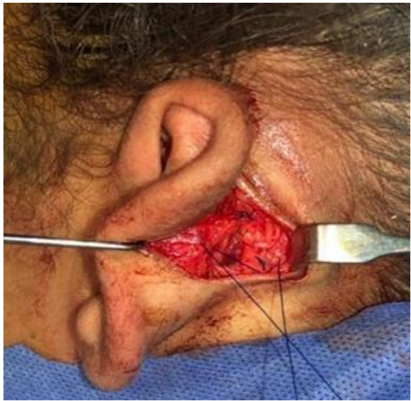
Fig (4): Furnas sutures and coverage with the distal based post-auricular facial flap.

Then three conchomastoid (Furnas) sutures were done using proline 4/0 sutures and lastly redraping of the distal based post-auricular facial flap for coverage was done (Figure 4).