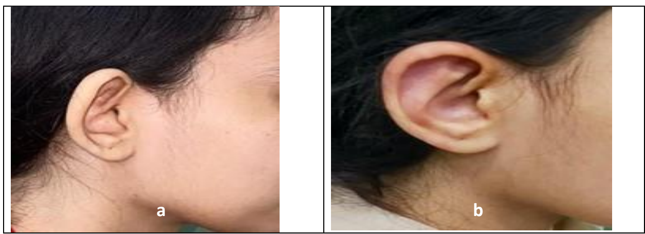
Fig (7): a. 20 years old female patient with prominent ear, b. 9 months postoperative otoplasty.