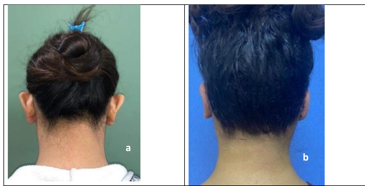
Fig (10): a. posterior view of a 23 old female patient with prominent ear, b. 2 weeks postoperatively.