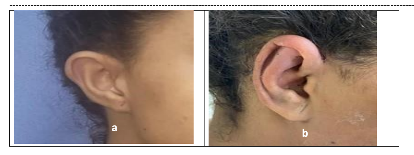
Fig (6): a.18 years old female patient with prominent ear, b. 2 weeks postoperative otoplasty

Eighteen patients were included in this study, with age range (16 -38 years) with an average age 23 years old. Ten females and eight males were the subjects of the study. All patients were discharged one day postoperatively. During the follow up, no bleeding or hematoma was found in any of the eighteen patients in the lateral surface of ear as there was no anterior dissection or anterior cartilage scoring. All cases had Mustarde and Furnas sutures. Whereas conchal hypertrophy excision was done only in two cases. Postoperative photos were taken, and measurements were taken at 6 months and analyzed statistically (Figure 6, 7, 8, 9, 10, 11, 12 and Table 1).