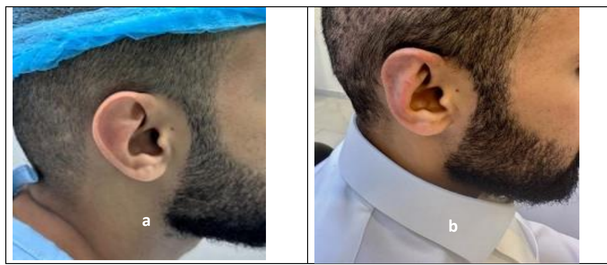
Fig (8): a. 30 years old male patient with prominent ear and effacement of antihelix, b. 6 months postoperative otoplasty.