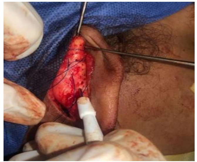
Fig (3): Fenestration of cartilage by punch biopsy needle on the posterior surface with applied Mustarde sutures.

Marking of antihelix was done using 27-gauge needles being dipped in methylene blue (3 needles). Fenestration of the cartilage was done using 1 mm punch biopsy needle, on the posterior surface, reaching the anterior surface of cartilage without reaching the skin, being supported anteriorly with the other hand, so that fenestration stopped at the level of skin. Number of fenestrations was variable, with more fenestrations at root of helix and less fenestrations at antihelix, it was dependent on size of cartilage per patient and the bending of the cartilage, 3-4 permanent Mustarde suture were applied using proline 4/0 sutures (Figure 3).