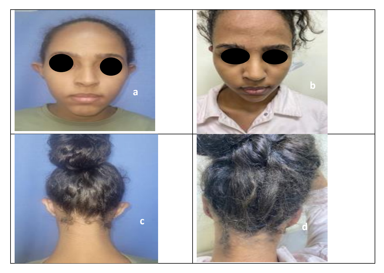
Fig (11): a. Preoperative 18 years old female patient with prominent ear A-P view, b. 4-months postoperative A-P view, c. Preoperative posterior view, d. 4-months postoperative posterior view.