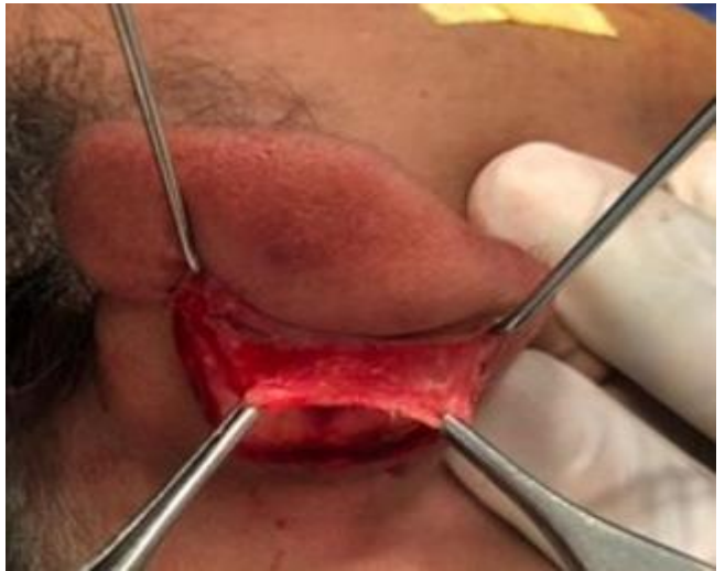
Fig (2): Posterior auricular incision with elevation of distal based post-auricular facial flap

Incision of the postauricular skin was done, skin was deepithelialized with a posterior auricular facial flap elevated distally based, and dissected till the helix rim, and then dissection to the mastoid process posteriorly was done (Figure 2).