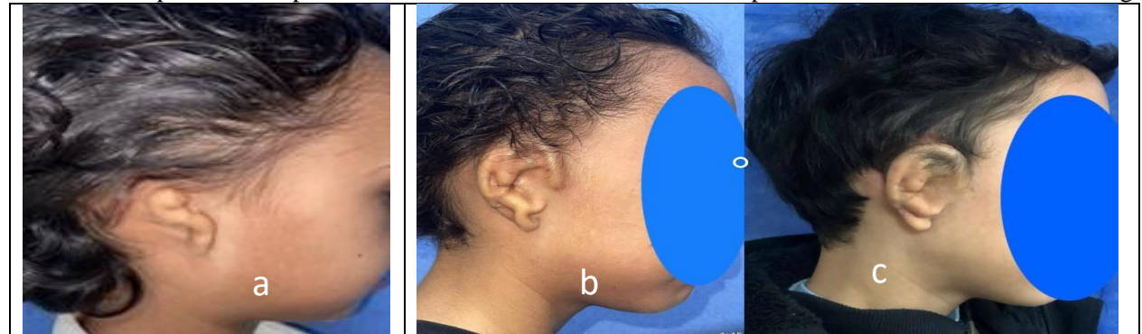
Fig (6): a. Right sided microtia in male patient, b. Reconstruction by 3D costochondral cartilage framework and insertion of the frame in a pocket dissected in ear lobe, c. Separation of the framework with minor transposition of ear lobe less than 45 degree.