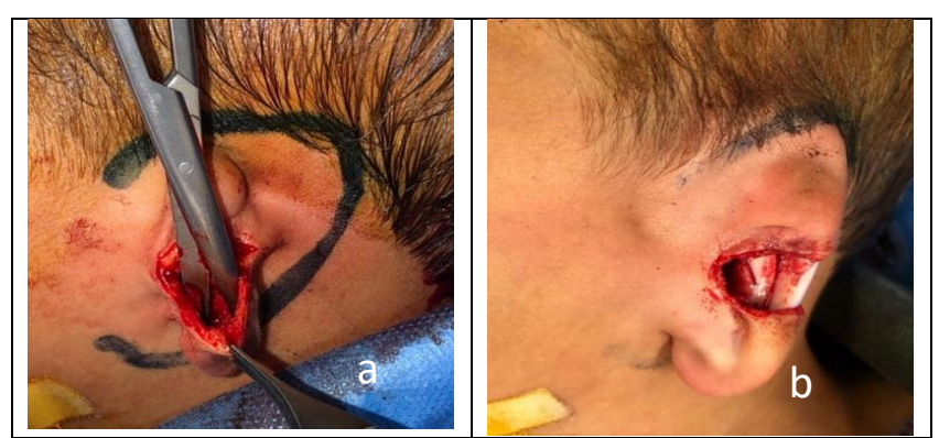
Fig (1): a. Male patient with unilateral microtia, dissection of ear lobe pocket b. Insertion of cartilaginous framework.

In group B, the same as group A was done but with no interference or pocket creation in the ear lobe, the ear lobe was addressed in the second stage.