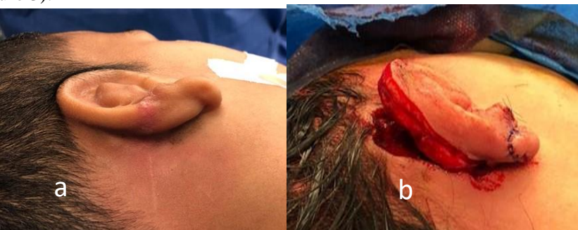
Fig (3): a. Male patient with unilateral microtia underwent reconstruction by 3D cartilaginous framework, b. Separation of upper 2/3 of auricle and creation auriculo-cephalic angle.

Separation of the upper 2/3 of the auricle from the head with creation of auriculo-cephalic angle and coverage of the post auricular sulcus with a split thickness skin graft harvested from the thigh were done, while the lobe was hanging freely from the first stage (Figure 3).