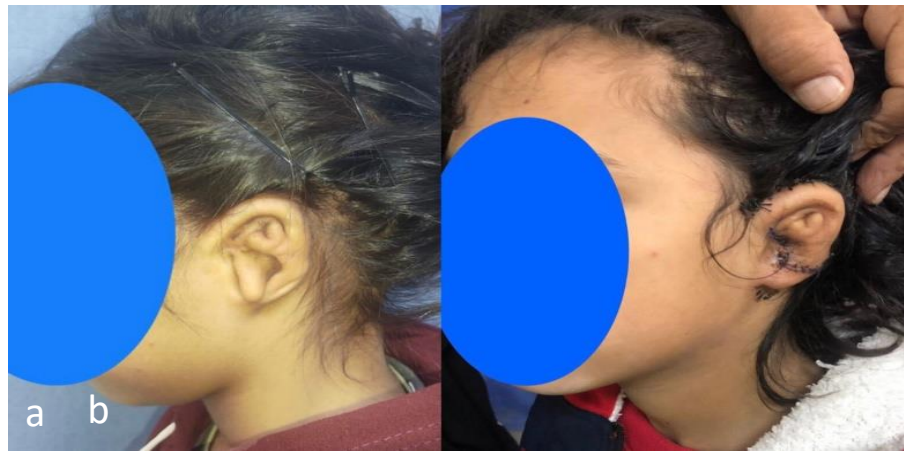
Fig (8): a. Left sided microtia in female patient, underwent reconstruction by 3D costochondral cartilage framework in auricular footprint without pocket dissection of ear lobe in first stage, b. Separation of the framework with major transposition of ear lobe of 170 degree.