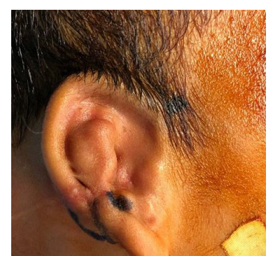
Fig (2): Minimal correction of ear lobe position was needed in group A.

Pushing the ear lobe down in the first stage by introducing the lower most part of the framework inside it may correct its position from the start or at least decreased the need for position adjustment (Figure 2).