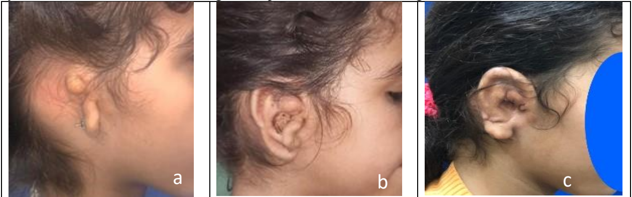
Fig (7): a. Right sided microtia in female patient, b. Reconstruction by 3D costochondral cartilage framework in auricular footprint without pocket dissection of ear lobe in first stage, c. Separation of the framework with major transposition of ear lobe of 160 degree.

Also, in group B , both stages passed uneventfully with no major complications of seroma, disruption, infection, extrusion of cartilage or necrosis of skin, except for two cases with minor disruptions, where one was managed with secondary sutures and the other with dressing with topical antibiotic cream (Figures 7-9)