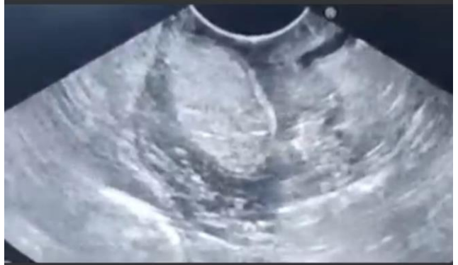
Figure 2: Rectal mass.