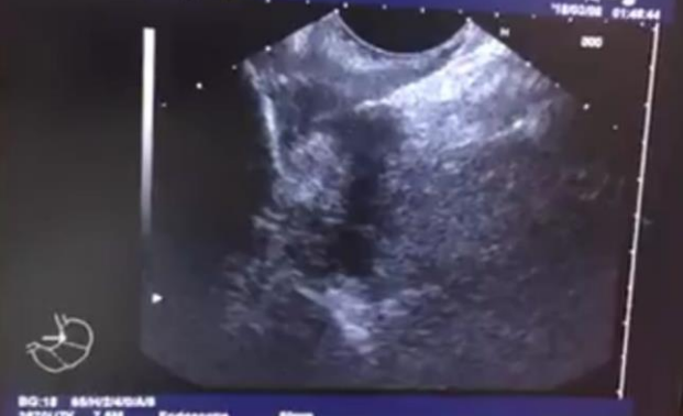
Figure 1: Rectal polyp.

Patients undergoing rectal surgery or endoscopic submucosal dissection (ESD) were monitored, with the examination of their outcomes conducted through histopathological methods.