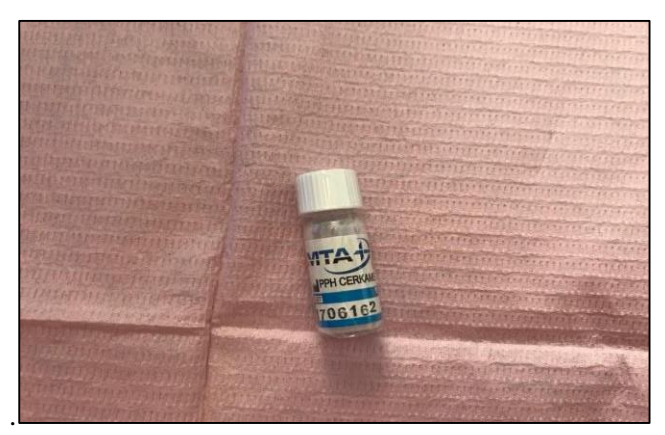
Figure 2: photograph showing mineral trioxide aggregate.