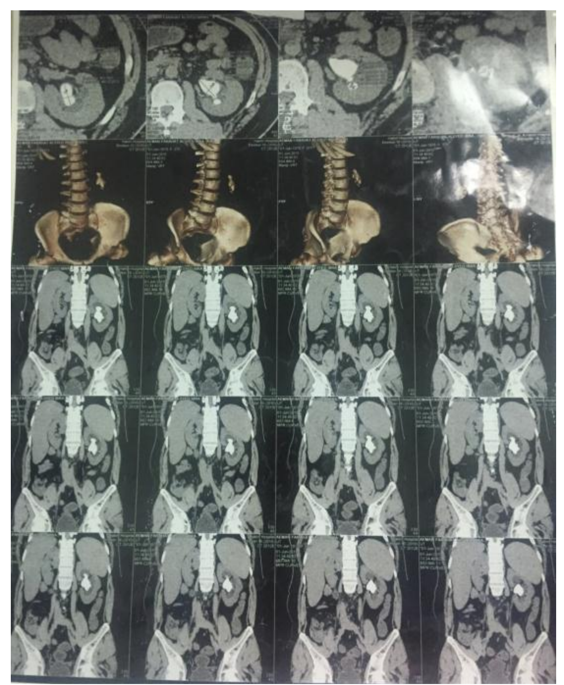
Figure (1): NCCT showing left staghorn stone