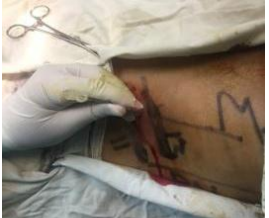
Figure (3): Needle puncture and advancement through intercostal space between the 11<sup>th</sup> and 12<sup>th</sup> ribs

In group B: The posterior axillary line, roughly halfway between the 12<sup>th</sup> rib and the iliac crest, is where all subcostal punctures are made (approximately 1 cm inferior and medial to tip of last rib).