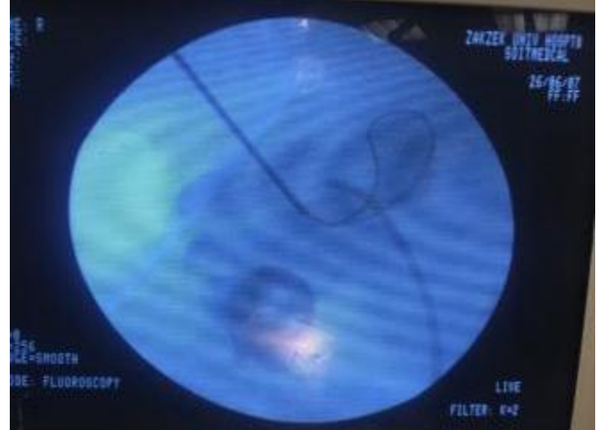
Figure (5): Advancement of guide wire into pelvicalyceal system