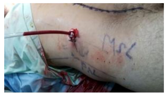
Figure (7): A nephrostomy catheter.

Postoperatively: CBC, chest X-ray, KUB, spiral CT, pelviabdominal ultrasound, were done to all patients.