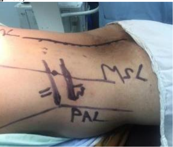
Figure (2): Site of supracostal puncture.

In Group A: Supracostal puncture was always performed in the region between the 11<sup>th</sup> and 12<sup>th</sup> ribs. The incision made just above the medial edge of the 12<sup>th</sup> rib, right above the scapular crease ( Figure 2 ). As the needle moved forward, it did so in the centre of the intercostal space, away from the intercostal nerve and the intercostal arteries. Puncturing the skin and subcutaneous tissue during complete expiration prevents damage to the lung or pleura, whereas puncturing the renal parenchyma during deep inspiration fully displaces the kidney downwards, facilitating access to the upper pole posterior calyx ( Figure 3 ).