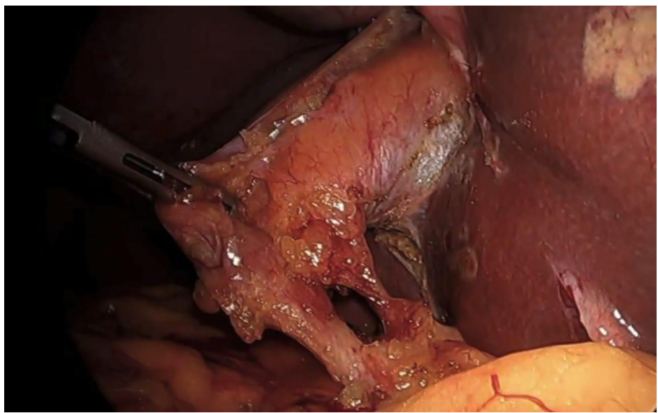
Figure 1: Intraoperative view after achievement of critical view safety

There were 28.9% and 39.5% diagnosed as biliary colic and chronic calculous among elderly group while there were 28.6% and 37.1% diagnosed as biliary colic and chronic calculous cholecystitis among young groups. There was no significant difference between groups regarding diagnosis. Table (2), Figure (2)